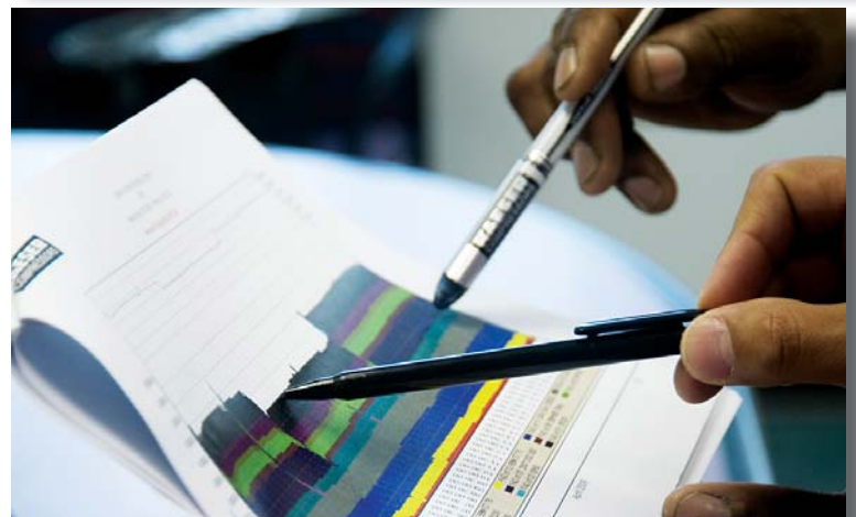
Data logging with highly accurate sensors are attached to the system to monitor the compressed air usage (top). Time-stamped data logging enables more thorough analysis (bottom).

Kaeser's Air Demand Analysis takes out the guesswork and provides unbiased compressed air system data collection to give you an accurate picture of system dynamics with meaningful analysis. Learn more at kaeser.com/ada .